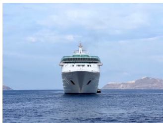
REV.FR. PJ ALINDOGAN (SPIRITUAL CHAPLAIN)

FULL PACKAGE OCT 17-31 (with airfare) $3,999 INSIDE CABIN $4,599 BALCONY CABIN